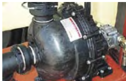
BANJO Hydraulic fast fill sys- tem