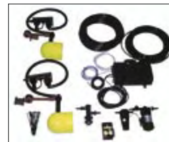
CYCLONE High perform- ance foam mark- ing system.