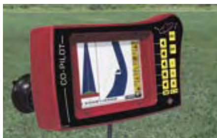
CO-PILOT GPS Field Guidance System