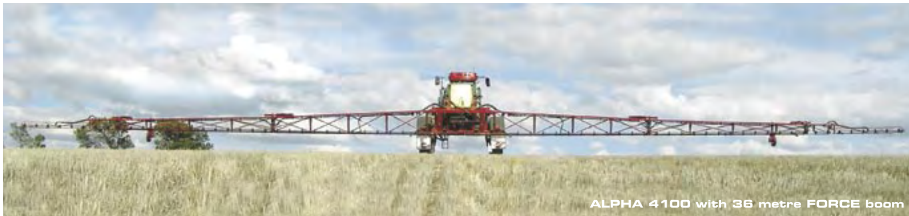
ALPHA 4100 with 36 metre FORCE boom