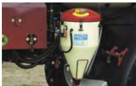
GRANNI-POT Chemical induction system.