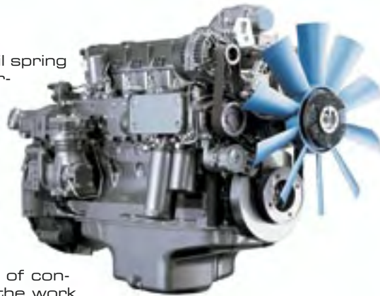
210 hp Deutz engine