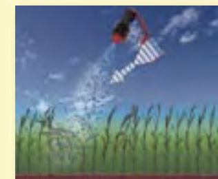
Forward angling up to +40°