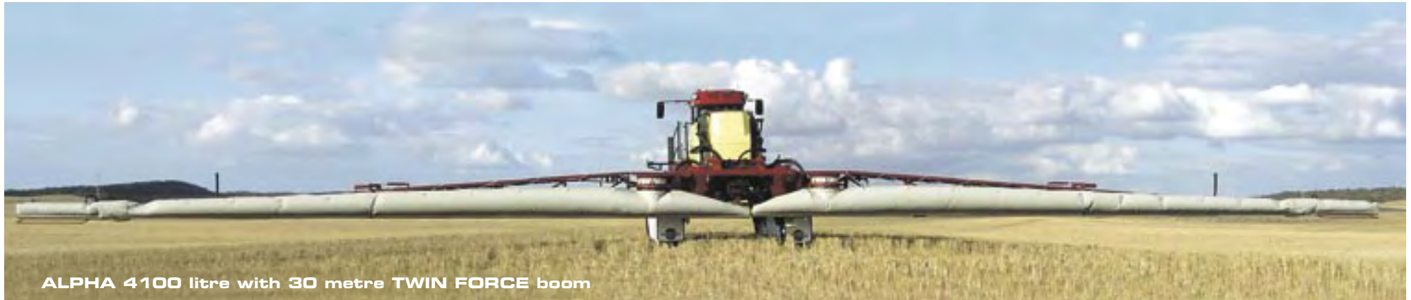
ALPHA 4100 litre with 30 metre TWIN FORCE boom