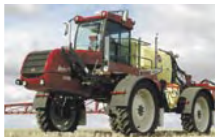
AutoSTEER Automated steering package.