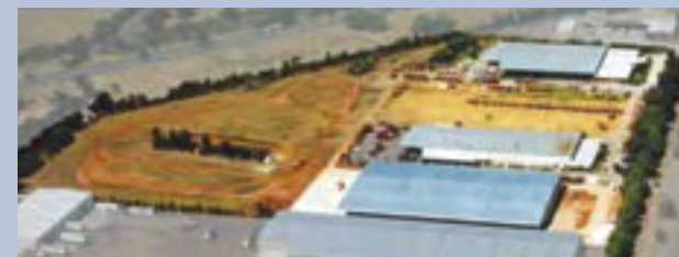
Production Facilities Adelaide

Our Adelaide based National Office incorporates major engineering, fabrication and assembly facilities and Australia's only customised test track to ensure the products we make are built for the demands of Australian farmers.