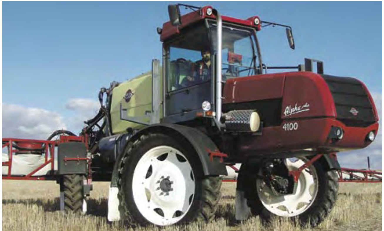
ALPHA is standard with 4 wheel drive and selectable 4 wheel steer

A safety locker of 180 litres allows storage of containers or various accessories used during the work. (Locker substituted if foam marker ordered)