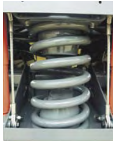
Active coil spring suspension